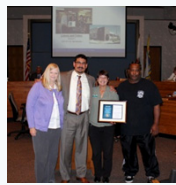
Loaves and Fishes

EMD's Environmental Health Division issued 595 Food Safety Awards of Excellence for 2013. The award was designed to recognize operators of food establishments in Sacramento County who have demonstrated excellent food safety and sanitation standards during their recent routine inspections.