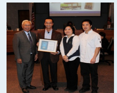
99 Ranch Market

Food establishments eligible for the Award include restaurants, school, coffee shops, delis, licensed health care facilities, retail markets, bars and bakeries. To qualify for the award, facilities must have had no documented major violations during the last three routine inspections conducted prior to July 1, 2013 and only a limited number of minor violations (number of minor violations allowed depends upon facility category).