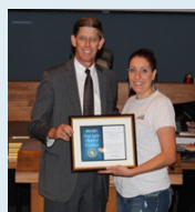
Central Station Grill

These Awards are a pleasurable way to highlight both the hard work of operators that make food safety a prior and the work of EMD employees.