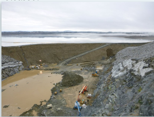
Construction site at Folsom Lake Dam below the leaking cofferdam. Heavy equipment present contained approx. 2000 gallons of diesel fuel.