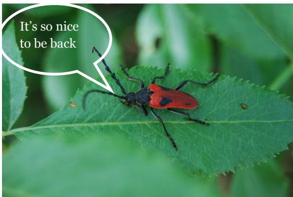
Valley Elderberry Longhorn Beetle found in 2 mitigation sites on the Feather River.

Two inhabitants return to the region after a long absence. Seen in habitat restoration projects completed by River Partners.