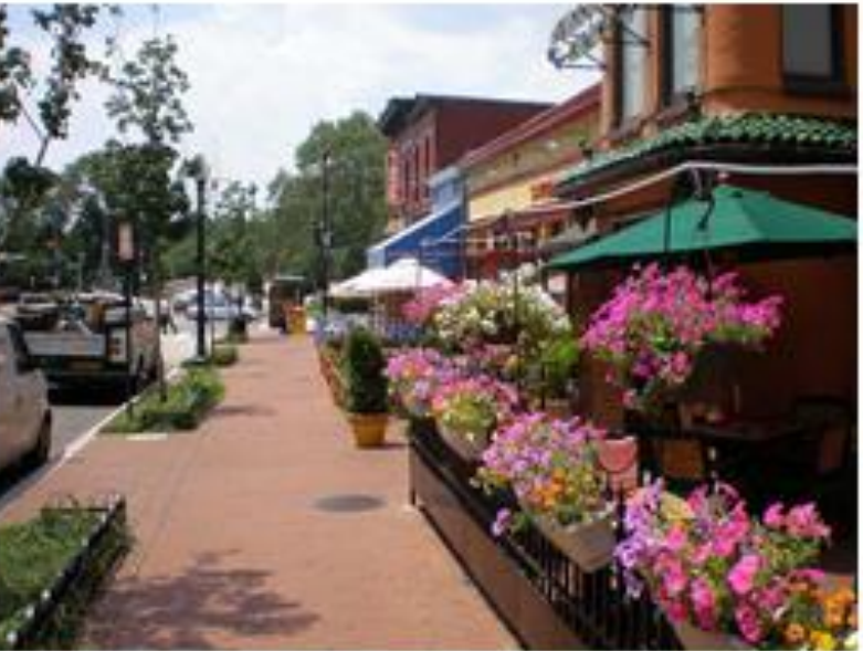
Planning for Active Design & Safety - Active Design for a Healthy Sacramento County