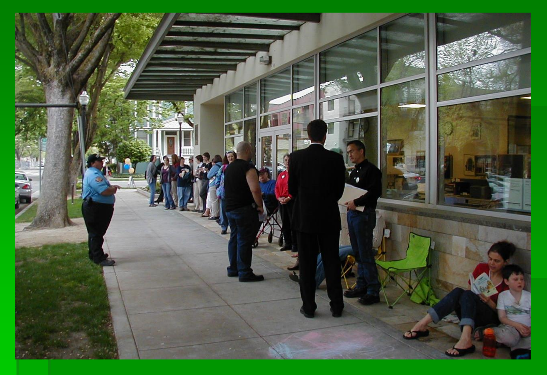
New Community Garden Plot Sign Ups