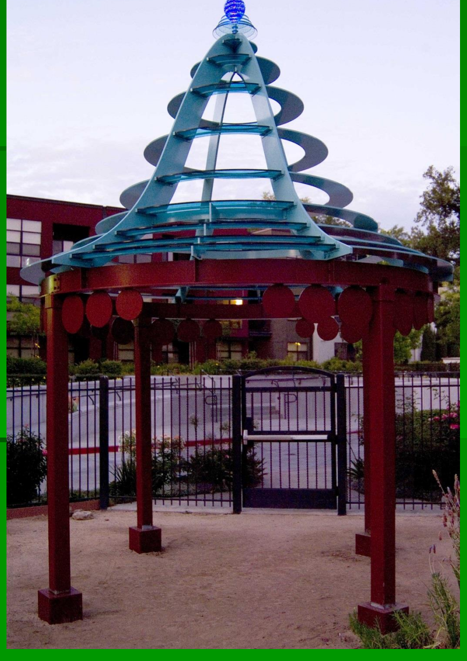
Art in the Garden