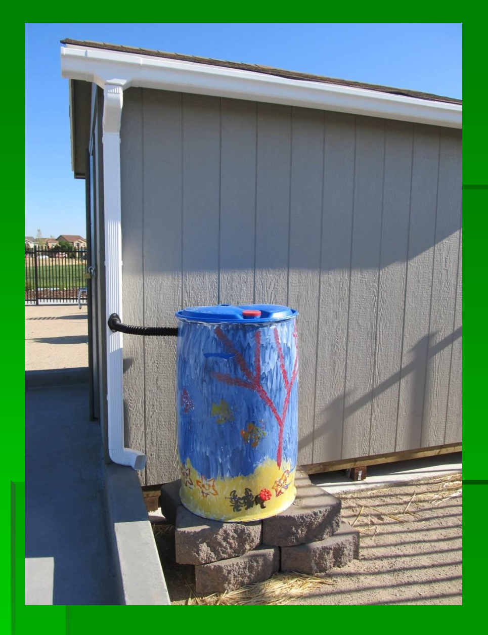
Rain Water Capture