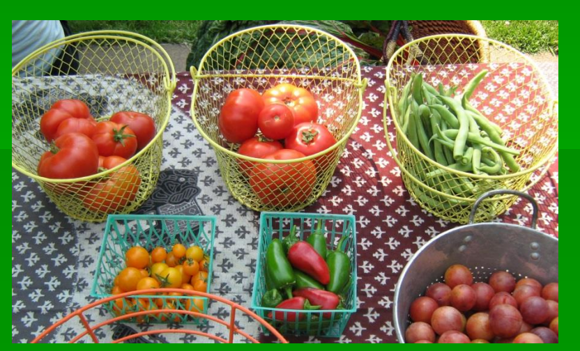
Fresh Organic Produce from Community Gardens