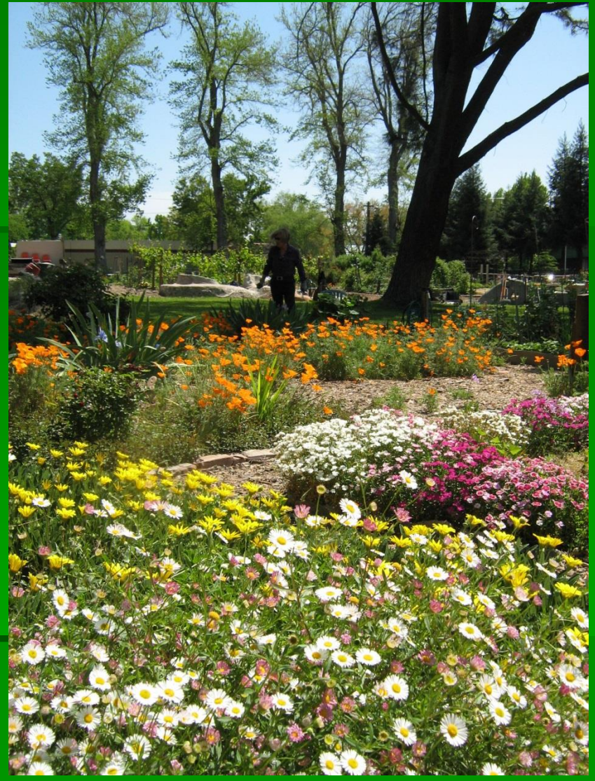
Plan for Pollinators - Important Habitat for Bees and a Vital part of a successful garden