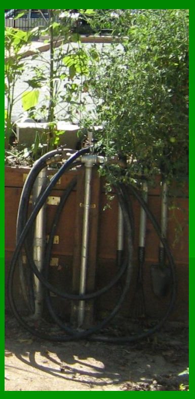
Make Gardens Accessible for All