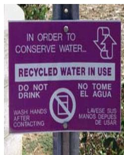
Recycled Water Use Area public notification signage example

"As the Department tasked with protection of public health and the environmental in Sacramento County, we view recycled water as a safe alternative water supply source and support its responsible use," Cecilia Jensen, Chief, Water Protection.