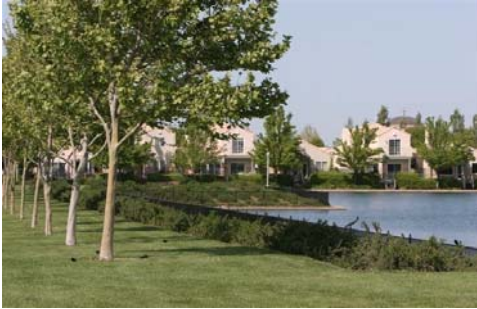
Recycled Water Irrigation in Laguna West, CA

The Water Recycling Program in Sacramento County is a partnership between the Sacramento Regional County Sanitation District (SRCSD), Sacramento County Water Agency