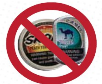
Flavored Smokeless Tobacco (e.g., SKOAL Wintergreen)