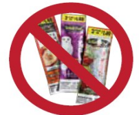
Flavored Little Cigars/Cigarillos (e.g., Swisher Sweets Grape)