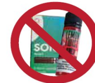
Flavored e-juice/pods (e.g., JUUL Menthol, Blu liquid Blueberry, Vuse Solo Melon)