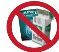
Menthol Cigarettes (e.g., Newport Menthol, KOOL Blue)