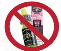
Concept Flavors (e.g., Unicorn Milk Ice, Tropical Mix)