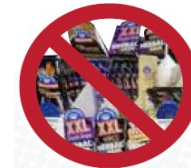
Flavored Wraps Backwoods Honey, High Hemp are Berry, Zig-Zag Orange)