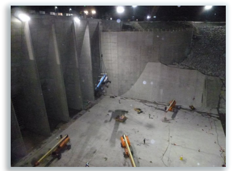
Heavy equipment being lifted out of flooding area.

Construction site at Folsom Lake Dam below the leaking cofferdam. Heavy equipment present contained approx.2000 gallons of diesel fuel.