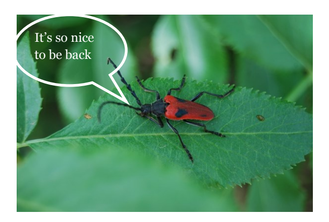
Valley Elderberry Longhorn Beetle found in 2 mitigation sites on the Feather River.

Two inhabitants return to the region after a long absence. Seen in habitat restoration projects completed by River Partners.